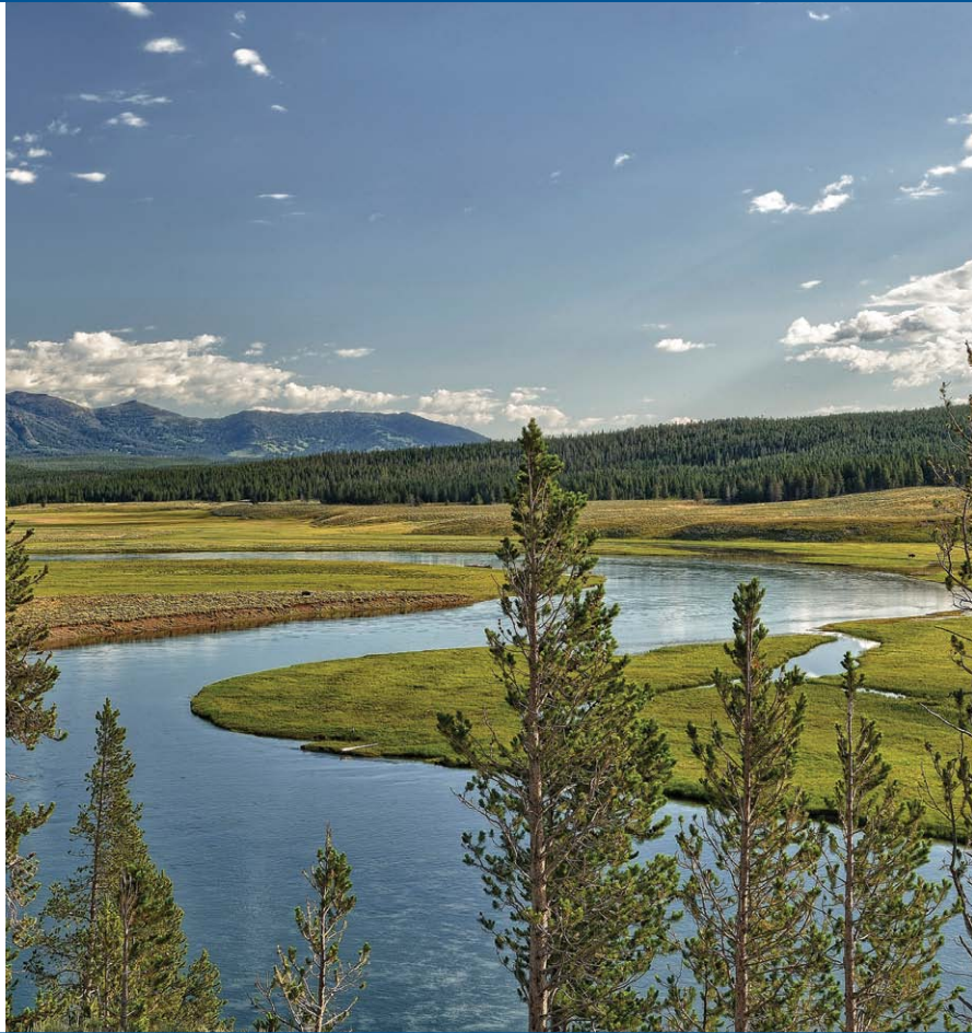
HAYDEN VALLEY, YELLOWSTONE

With this transformative approach and our ambitious plan of action, Defenders will continue to be an advocate for wolves on the ground, in the courts and in the halls of Congress. We will be ready to navigate the twists and turns and roadblocks ahead on the road to full recovery of our native wolf species in the lower 48 states.