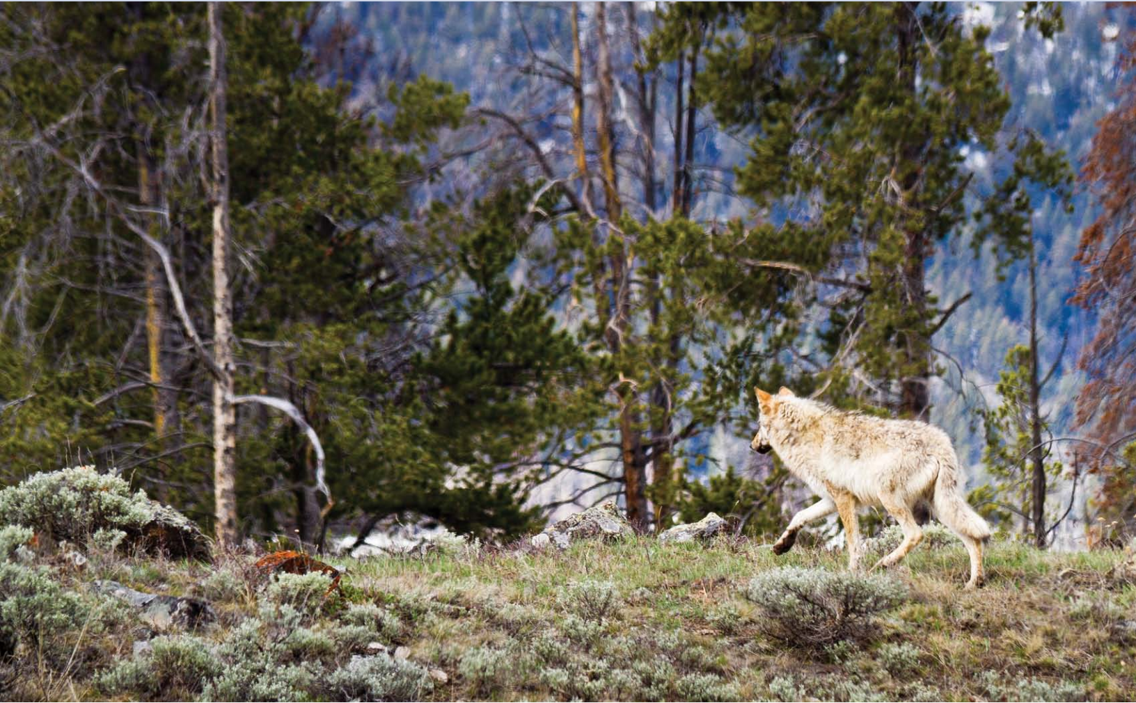
LAMAR VALLEY, YELLOWSTONE NATIONAL PARK

W olf conservation is at a crossroads. The U.S. Fish and Wildlife Service (FWS), states and others are making decisions critical to existing populations of our nation's native wolf species and to efforts to restore them in additional areas.