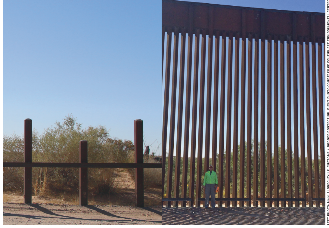
Bollard wall (right) is replacing existing vehicle barriers (left) on the U.S.-Mexico border. (Photos not to scale.)

The New Mexico border with Mexico is 180 miles long and bisects stretches of the vast Chihuahuan Desert and the rugged Sky Islands landscape . The Chihuahuan Desert has extraordinary diversity of succulents and cactuses, including the largest assemblage of endangered cactuses in America. This desert is also part of the historical range of the Mexican gray wolf , a species only recently reintroduced to the United States. In 2017, a Mexican wolf was tracked moving from Mexico to the United Sates and back in an area where new bollard wall is now being installed.