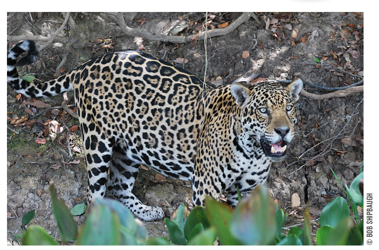
Jaguars from Mexico recently started venturing into Arizona, This cross-border movement is essential to the recovery of a U.S. population.

The Altar Valley Conservation Alliance, formed by landowners in south-central Pima County has directed