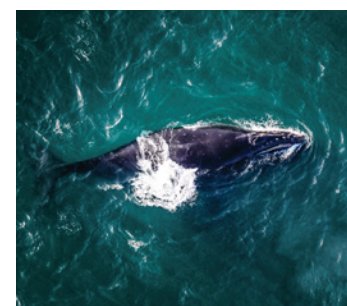
NORTH PACIFIC RIGHT WHALE NOAA