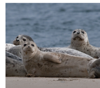
HARBOR SEAL