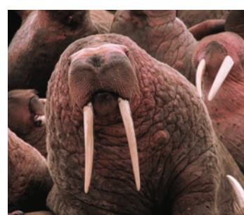
PACIFIC WALRUS USFWS