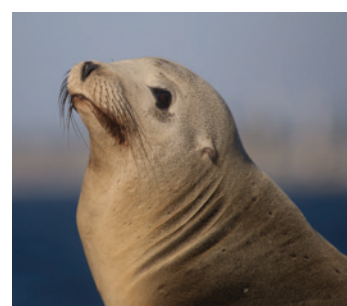
STELLER SEA LION NOAA