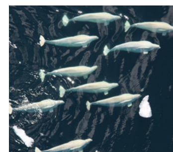
BELUGA WHALE NOAA/NMFS