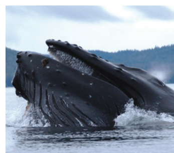
HUMPBACK WHALE NOAA