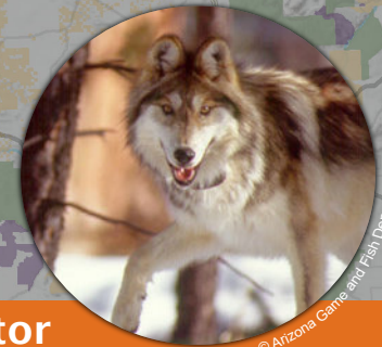
© Arizona Game and Fish Department

Species at risk: Mexican gray wolf 2 project areas • Replacing ~70 miles of existing vehicle barrier with new pedestrian wall