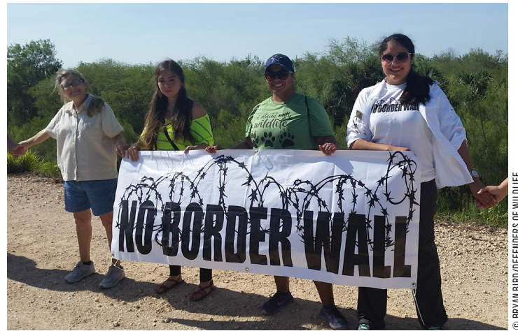
Anti-wall protestors unite in Santa Ana National Wildlife Refuge, a top U.S. birding spot that contributes more than $35 million per year to the local economy.

“Putting the border wall in the Santa Ana would be like dropping a bomb on it.”