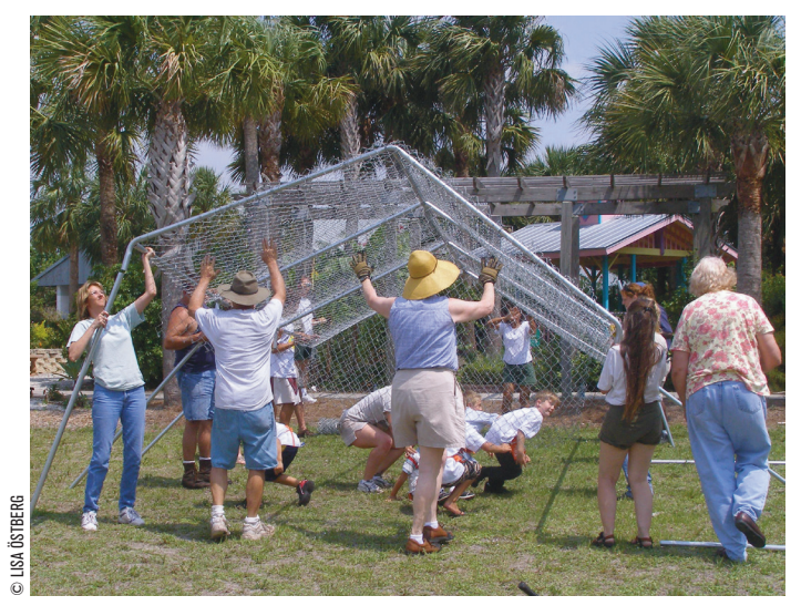
Volunteers erect a panther-resistant enclosure as a demonstration project on the grounds of a county extension office. Defenders helps rural residents build these pens to keep livestock and pets safe at night—prime time for panthers.

To build the political will and capital to keep roadways safe for wildlife, we hold consensus-building meetings with highway authorities, wildlife agencies, landowners and conservationists and reach out to the public to get citizens involved.