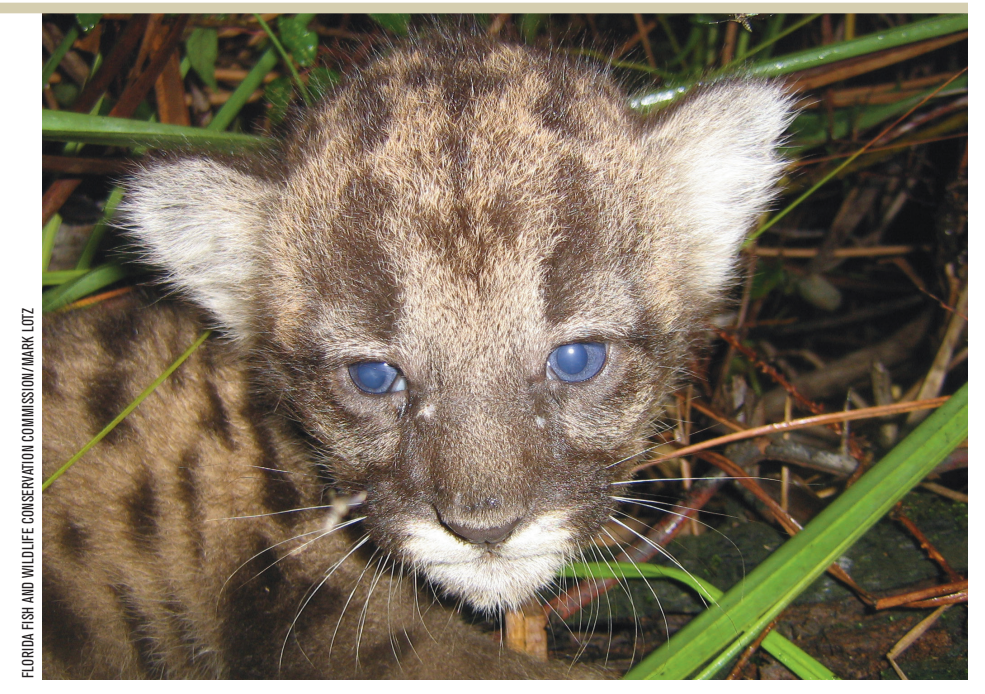
A panther kitten waits in the family den for the return of its mother, a radio-collared female that biologists are tracking. Knowing the mother is off hunting, the researchers can safely collect data on the young cat.