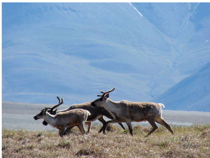
CARIBOU