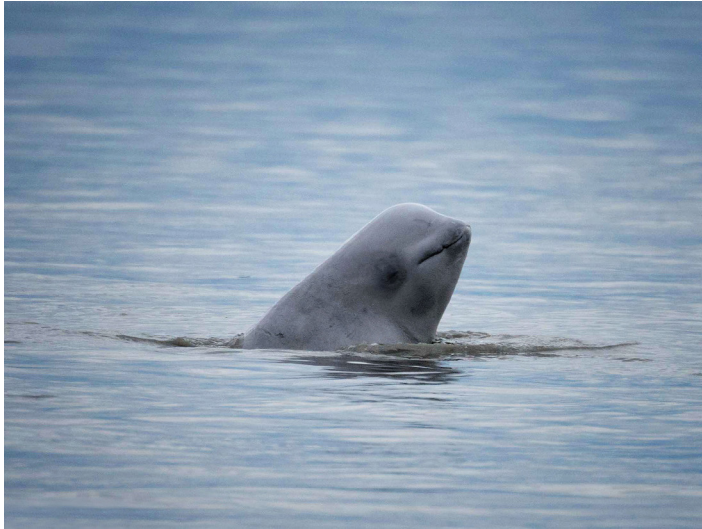
BELUGA WHALE