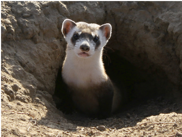
BLACK-FOOTED FERRET

four swift fox kits were born on the Fort Belknap Indian Reservation in Montana, the result of Defenders' work to recover this imperiled species across its historical range in the Great Plains. We continued our partnership with the Assiniboine and Gros Ventre Tribes to relocate 49 more swift foxes from Wyoming and Colorado to Fort Belknap.