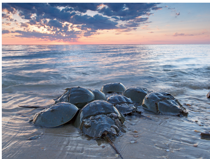
HORSESHOE CRABS

in Alaska ended with success when the Biden administration announced full restoration of protections for this remarkable landscape, reinstating the National Roadless Conservation Area rule and shutting down the largest old-growth forest logging project proposed in decades. This forest is one of the world's largest carbon reservoirs and home to imperiled species like the Alexander Archipelago wolf, Prince of Wales flying squirrel and Queen Charlotte goshawk.