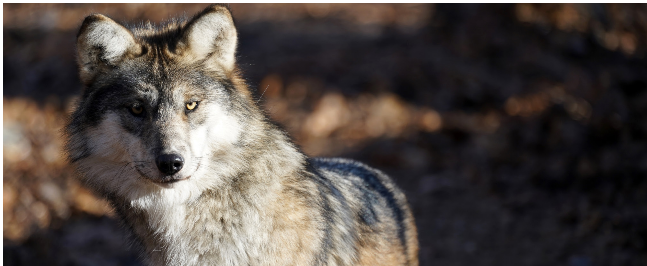
MEXICAN GRAY WOLF

DEFENDERS OF WILDLIFE made important progress for imperiled species and vital landscapes across the United States in 2021.