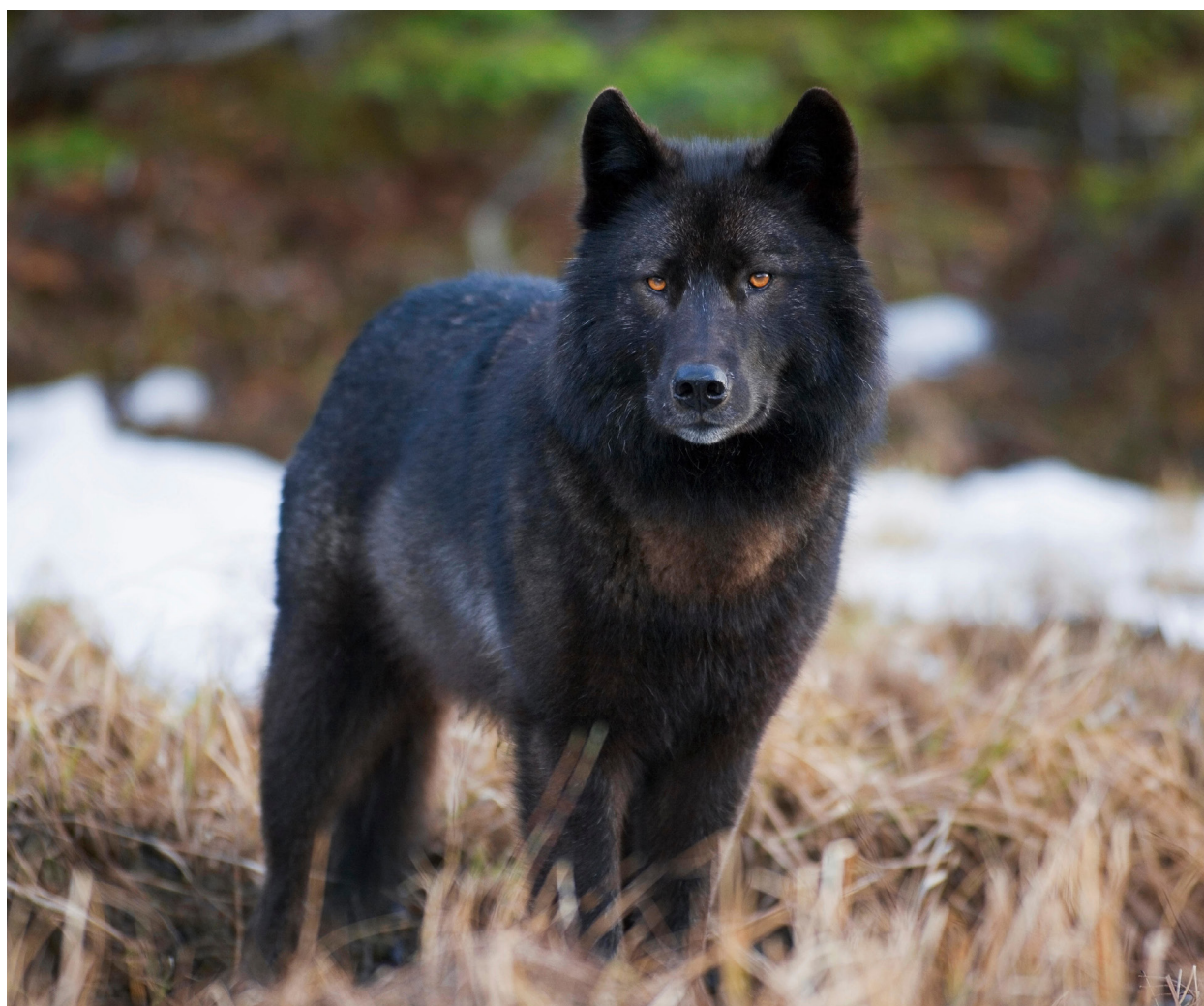
ARCHPELAGO WOLF

DEFENDERS' SUCCESSFULLY ADVOCATED for the Endangered Species Act (ESA), the bedrock law that protects our nation's wildlife from extinction. We celebrated President Biden's decision to reverse harmful rules enacted by the previous administration that weakened the ESA. With an escalating extinction crisis at hand, we desperately need to strengthen and fully fund the ESA. Defenders will continue to defend our critical environmental laws and all the imperiled species that rely on them for their survival.