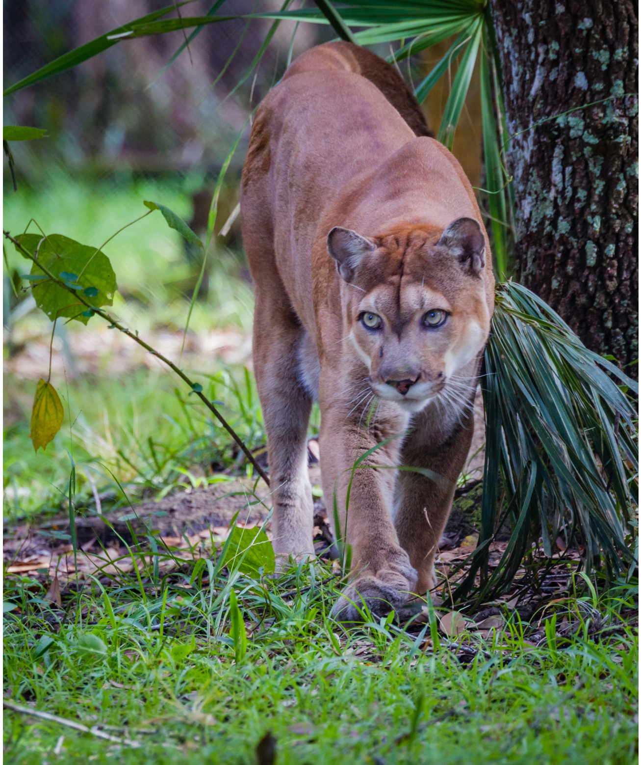
FLORIDA PANTHER