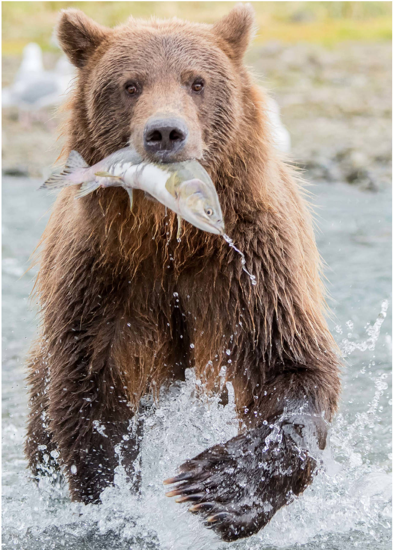
GRIZZLY BEAR