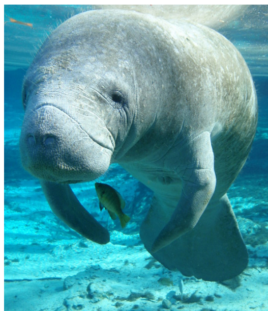
MANATEE | TRACY COLSON/USFWS

LOBBYISTS worked around the clock to keep wildlife and climate priorities in the Infrastructure Investment and Jobs Act . We also continue fighting to keep important wildlife and habitat funding in relevant appropriations bills .