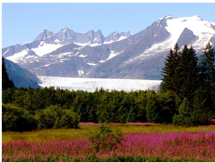
MENDENHALL GLACIER/TONGASS NATIONAL FOREST

in the Arctic National Wildlife Refuge in Alaska, Defenders celebrated President Biden's suspension of the oil and gas leasing permits issued at the end of the previous administration.