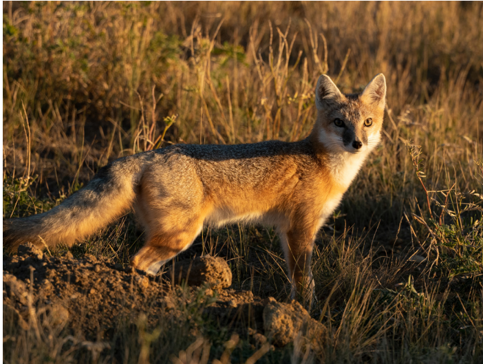
SWIFT FOX

continuing to expand our partnerships with the Intertribal Buffalo Council and numerous tribes to restore bison to suitable prairie grassland habitat. We helped establish a conservation herd on protected grasslands in Colorado (and celebrated the birth of 7 calves) and continued our support of the bison conservation transfer program by transporting Yellowstone bison to the Fort Peck Reservation in Montana that would have otherwise been sent to slaughter. Defenders also assisted in transferring over 50 bison from the Fort Peck Reservation to the Yakama Nation in Washington and the Modoc Nation in Oklahoma. We proudly celebrated the 10-year anniversary of our highly effective Yellowstone bison coexistence program which provides funding for exclusion fencing on private property and builds acceptance and tolerance for roaming bison.