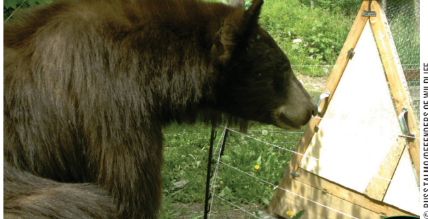
A black bear is about to find out that this chicken coop is protected by a newly installed electric fence.