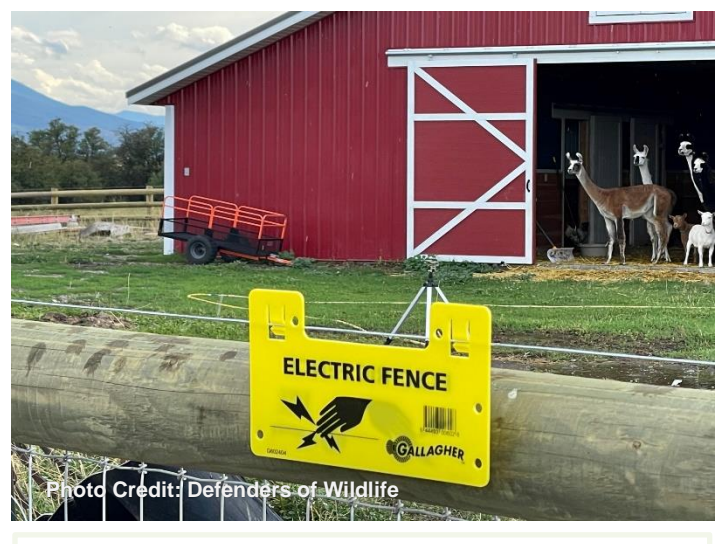
Above: Defenders, USDA Wildlife Services, and the Confederated Salish and Kootenai Tribes complete an electrified barnyard in the Mission Valley of Montana

Now in its thirteenth year, the Electric Fence Incentive Program has a longstanding track record of success. The program continues to expand its reach across grizzly habitat in Montana, Idaho, Wyoming and Washington.