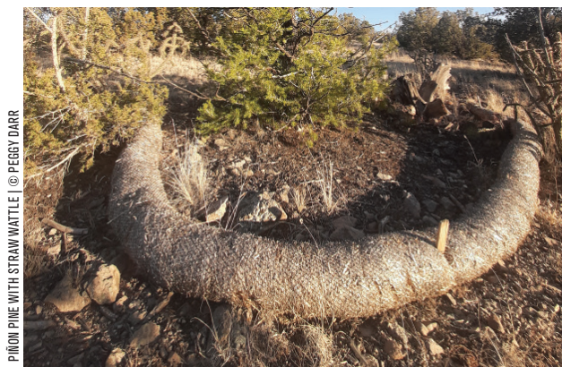
PIÑON PINE WITH STRAW WATTLE