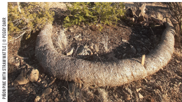
PIÑON PINE WITH STRAW WATTLE