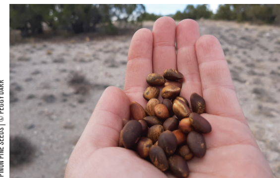
PIÑON PINE SEEDS

Defenders of Wildlife and our partners will use your seeds to plant new piñon pines for pinyon jays—and people.