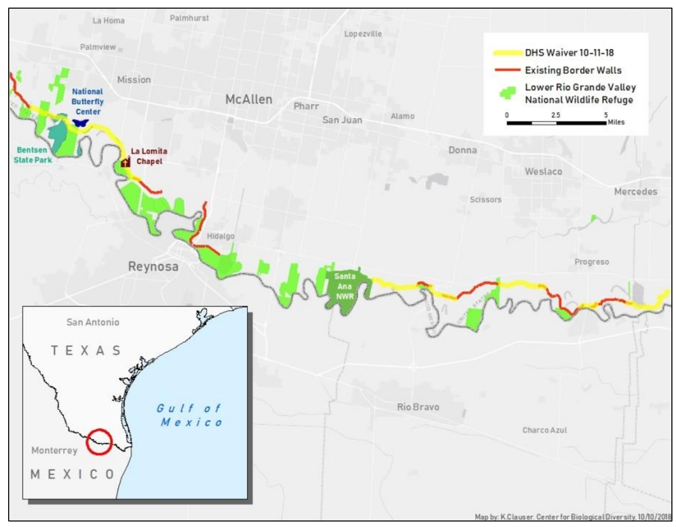
Figure 2. Map of Proposed Construction related to Hidalgo County Waiver

construction of roads and physical barriers" in 6 different areas of Hidalgo County, Texas, totaling approximately 18 miles of linear border. 83 Fed. Reg. 51,472. The map of the proposed construction related to the Hidalgo County Waiver is in Figure 2, below.