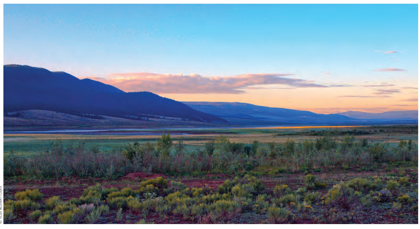
The Sky Islands, also known as the Madrean Archipelago, is a unique landscape of mountains and grasslands globally recognized for its biodiversity.

orested mountain ranges rise from desert grasslands like towering islands in a sea. This is the aptly named Sky Islands, a globally unique region where temperate and subtropical zones, the Chihuahuan and Sonoran deserts and conservation-minded Mexicans and Americans come together. Successful conservation here often requires cross-border collaboration, but with all the talk of the wall, a shift is occurring. "The current political reality has complicated cooperation," says Mirna Manteca, a biologist with the nonprofit Sky Islands Alliance.