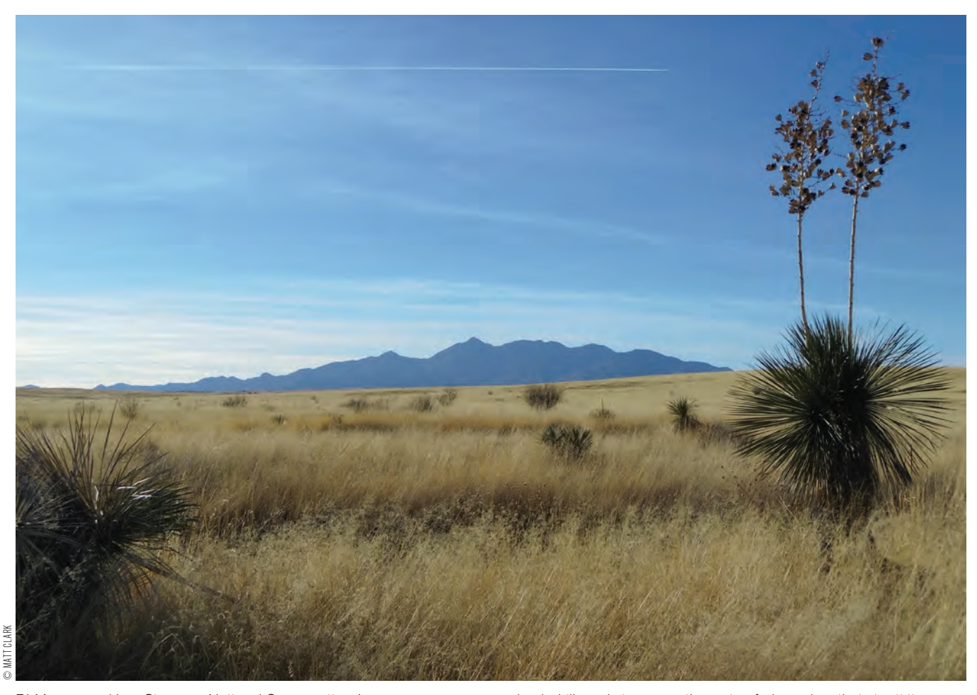
BLM-managed Las Cienegas National Conservation Area encompasses grasslands, hills and cienegas—the spring-fed marshes that give it its name.

and research through its YES! Program (Cienega Watershed Partnership 2018).