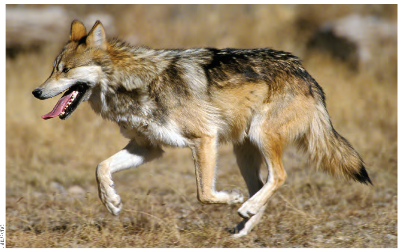
Completing the border wall would undercut the millions of dollars already invested in Mexican gray wolf recovery by the United States and Mexico.

Diversion of funds. Money spent on the wall is money not spent on conservation. The National Fish and Wildlife Foundation (NFWF) estimates that it would cost $265 million to restore populations of key species like black-tailed prairie dogs and the grasslands, wetlands and other habitat they need in the U.S. and Mexican Sky Island landscape (NFWF 2009). That is roughly the cost of building 10 miles of border wall at $25 million per mile.