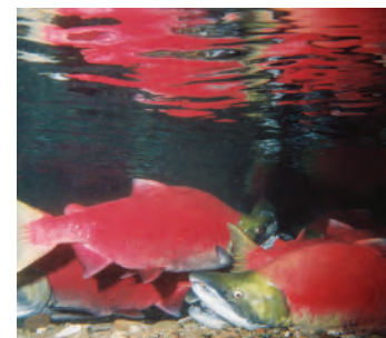
PACIFIC SOCKEYE SALMON