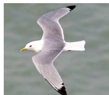
BLACK-LEGGED KITTIWAKE