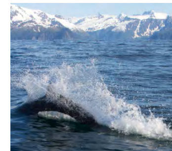
DALL'S PORPOISE