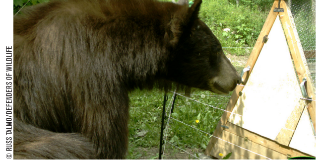
A black bear is about to find out that this chicken coop is protected by a newly installed electric fence.