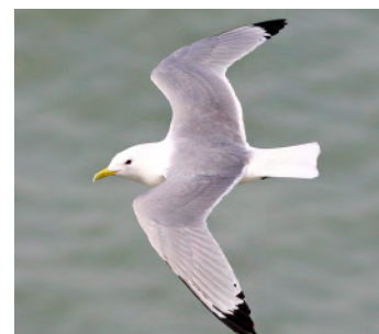
BLACK-LEGGED KITTIWAKE