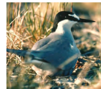
ALEUTIAN TERN USFWS