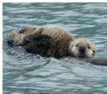
NORTHERN SEA OTTER USFWS Alaska Region