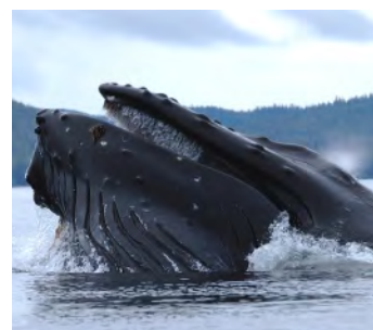
HUMPBACK WHALE NOAA