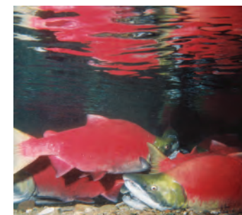
PACIFIC SOCKEYE SALMON