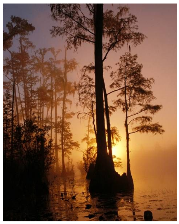
Okefenokee National Wildlife Refuge, GA