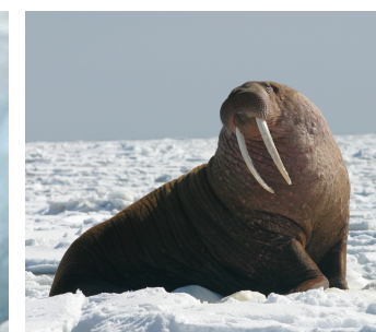
PACIFIC WALRUS