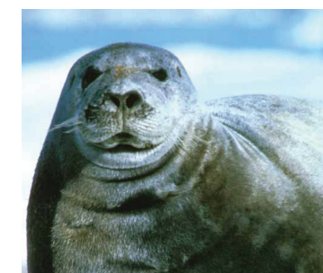
BEARDED SEAL, Mike Spindler, USFWS

Content may not reflect National Geographic's current map policy. Sources: National Geographic, Esri, DeLorme, HERE, UNEP-WCMC, USGS, NASA, ESA, METI, NRCAN, GEBCO, NOAA, increment P Corp.