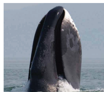
BOWHEAD WHALE