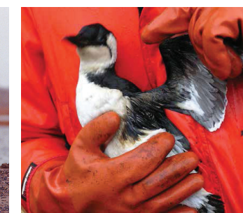
COMMON MURRE AFTER OIL SPILL OFF UNALASKA