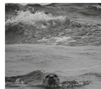
SPOTTED SEAL