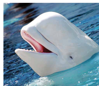
BELUGA WHALE