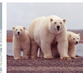
POLAR BEAR