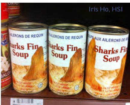
Iris Ho, HSI

A 3 September 2013 article reported that the Marshall Islands disposed at sea, fins and skins from approximately 50 sharks that were seized from a Chinese longline vessel that was subsequently fined US$120,000. In 2011, Marshall Islands adopted a ban on commercial shark fishing.