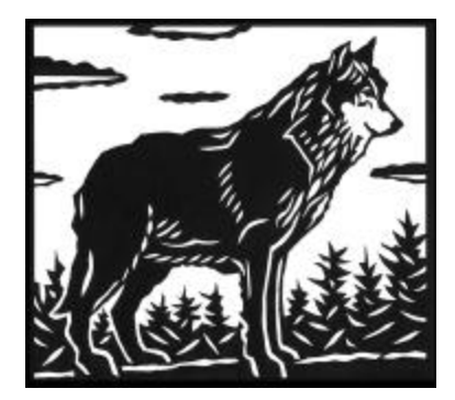
A fundamental premise of all biodiversity strategies is that they must be based on credible scientific information and sound analysis.

O ne of the first steps in considering if and how a biodiversity project in Washington state should be undertaken was to examine what has been done elsewhere and to learn the lessons from other state initiatives. Some of the work done by the Environmental Law Institute to summarize the programs of the various states was enlightening (Environmental Law Institute 2001), as was, to a very great extent, a review of the processes and lessons learned from the Oregon Biodiversity Project, conducted from 1993 to 1998 (Defenders of Wildlife 1999).